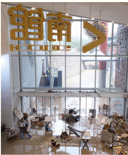
Figure Tells the Truth